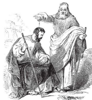
Moses anoints Aaron as High Priest by pouring specially prepared oil over his head.