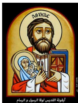
Syrian Orthodox icon of St. Luke