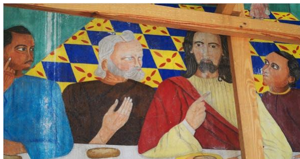
Last Supper Detail from the mural at Ste. Trinite Cathedral in Port-au Prince, Haiti

All baptized Christians are welcome to receive Holy Communion. Those worshipping remotely are invited to pray the Act of Spiritual Communion which will be on your screen.