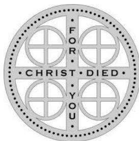
The Church War Cross.

Now known as the Episcopal Church Service Cross.