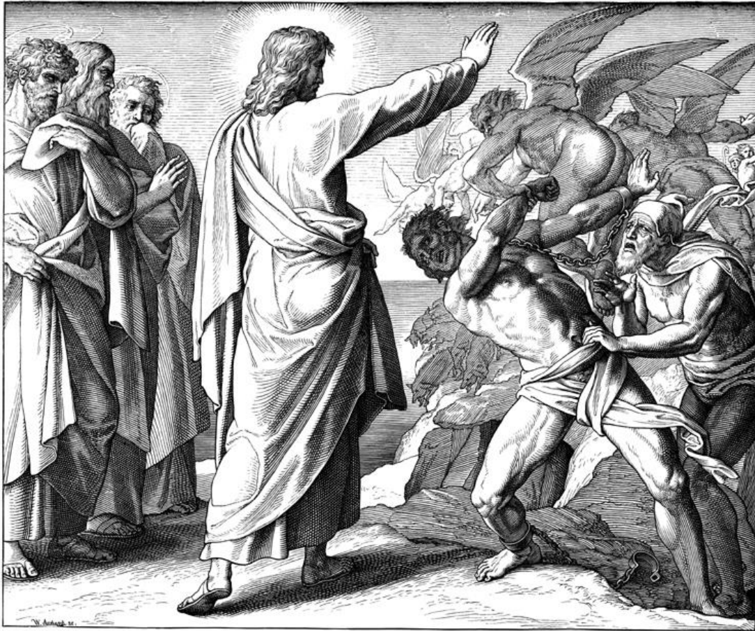
Jesús treibet Teufel aus.

Und siehe, sie schrien und sprachen: ach Jesu, du Sohn GOTTES, was haben wir mit dir zu thun? Bist du herkommen, uns zu quälen, ehe denn es Zeit ist? Es war aber ferne von ihnen eine große Heerde Säue an der Weide. Da baten ihn die Teufel und sprachen: willst du uns austreiben, so erlaube uns in die Heerde Säue zu fahren. Und er sprach: fahret hin.