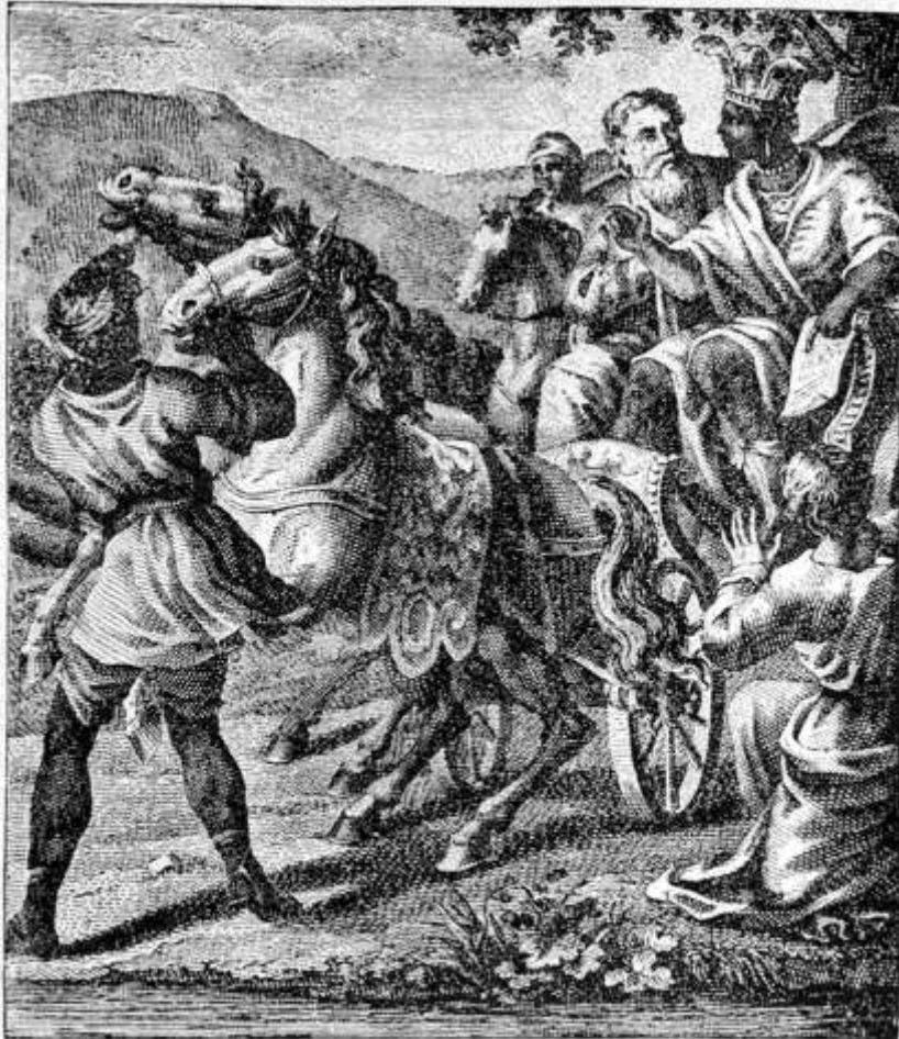
Philip and the Ethiopian Eunuch. "And he preached to him Jesus." Acts 8, 35.