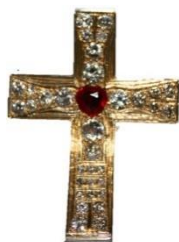
Cross from the foot of the Jubilee Chalice